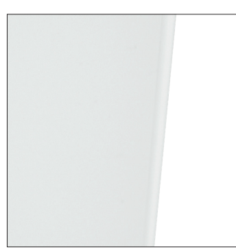
OP opal diffusor