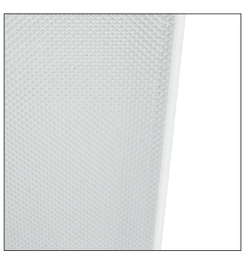
MP19H microprismatic diffusor